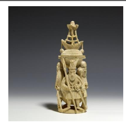
Benin Ivory Salt Cellar, Nigeria (Edo peoples) 17<sup>th</sup> century (British Museum)

Benin Ivory Mask of Queen Mother, Nigeria (Edo peoples) 16<sup>th</sup> century (British Museum)