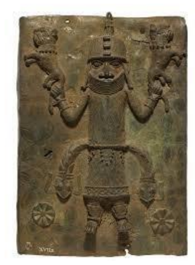
Benin Plaque, Nigeria (Edo peoples) 16<sup>th</sup> century (British Museum)

Antelope Headdress, Mali (Bamana peoples) 19<sup>th</sup> century/early 20<sup>th</sup> century (Metropolitan Museum of Art, U.S.)