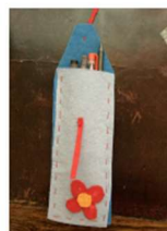
Try it out!