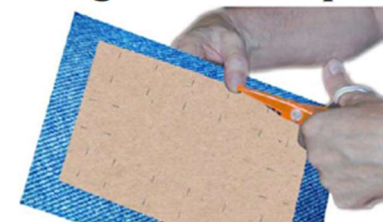
Ensure template is secured to fabric to allow for accuracy. Double sided tape can be used instead of pins to do this.