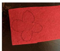
Draw shapes for decoration Make it simple!