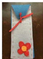
Glue your decoration on the front