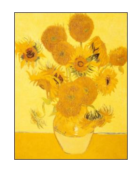
Van Gogh, Sunflowers, (1888)