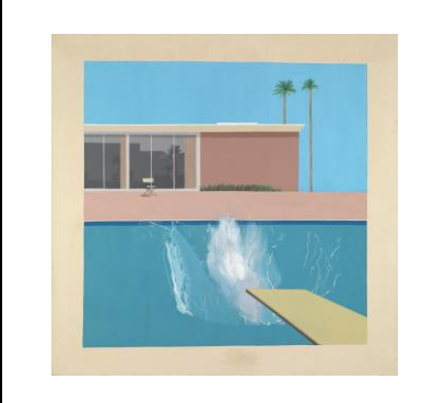
Hockney , A Bigger Splash, (1967)