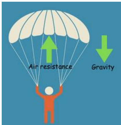
Air resistance slows down the parachute as gravity pulls it to the ground.