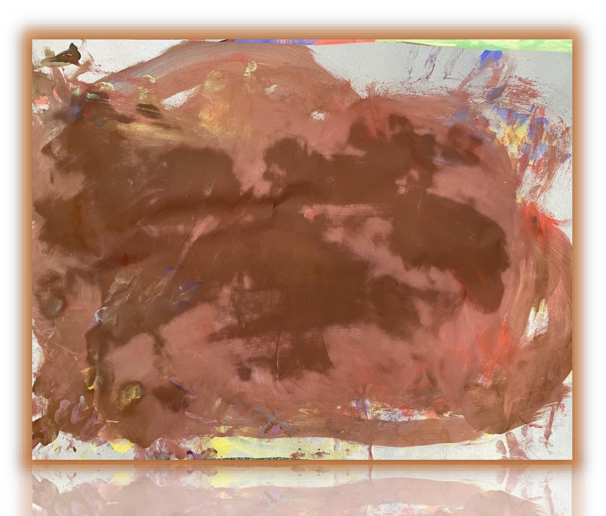
No.1 - Kaboom! - Gone too far