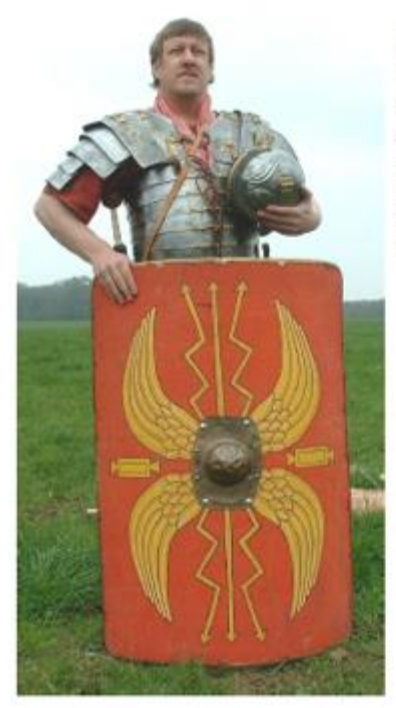
ROMAN SOLDIER'S SHIELD - SCUTUM You will need a large rectangle of cardboard.

Roman legionary helmets are available from English Heritage sites and the internet.