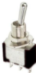
Toggle switch Simple on/off switch